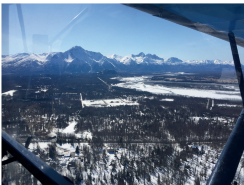
View of Alaska from the sky