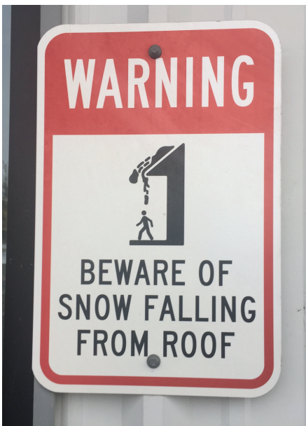
Sign at a store in Palmer

As you might guess, these have been a busy two months for us. We sold or gave away almost all our stuff (we are moving from New Zealand back to America), and then flew with 11 suitcases from New Zealand to Australia to Hawaii to Alaska! We have been staying with friends for several weeks while Dad works at the Air Force base in Anchorage, and we are about to fly to Kansas so we can see family and so mom can go to a great doctor. Please pray for us as we will be on the move for several months before my dad gets a job as a pastor and we finally settle down. Also please pray for my mom's healing from cancer. I hope you have had a blessed two months as well. :)