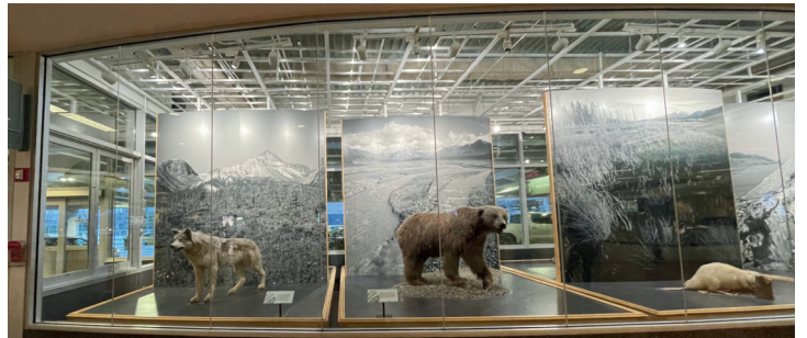
Display at the Anchorage airport